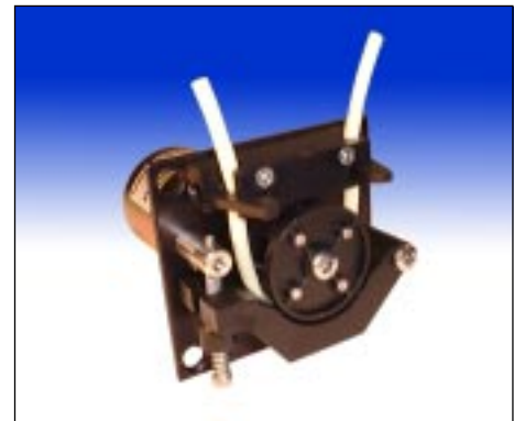
400F/B1 compact instrument quality one channel pump