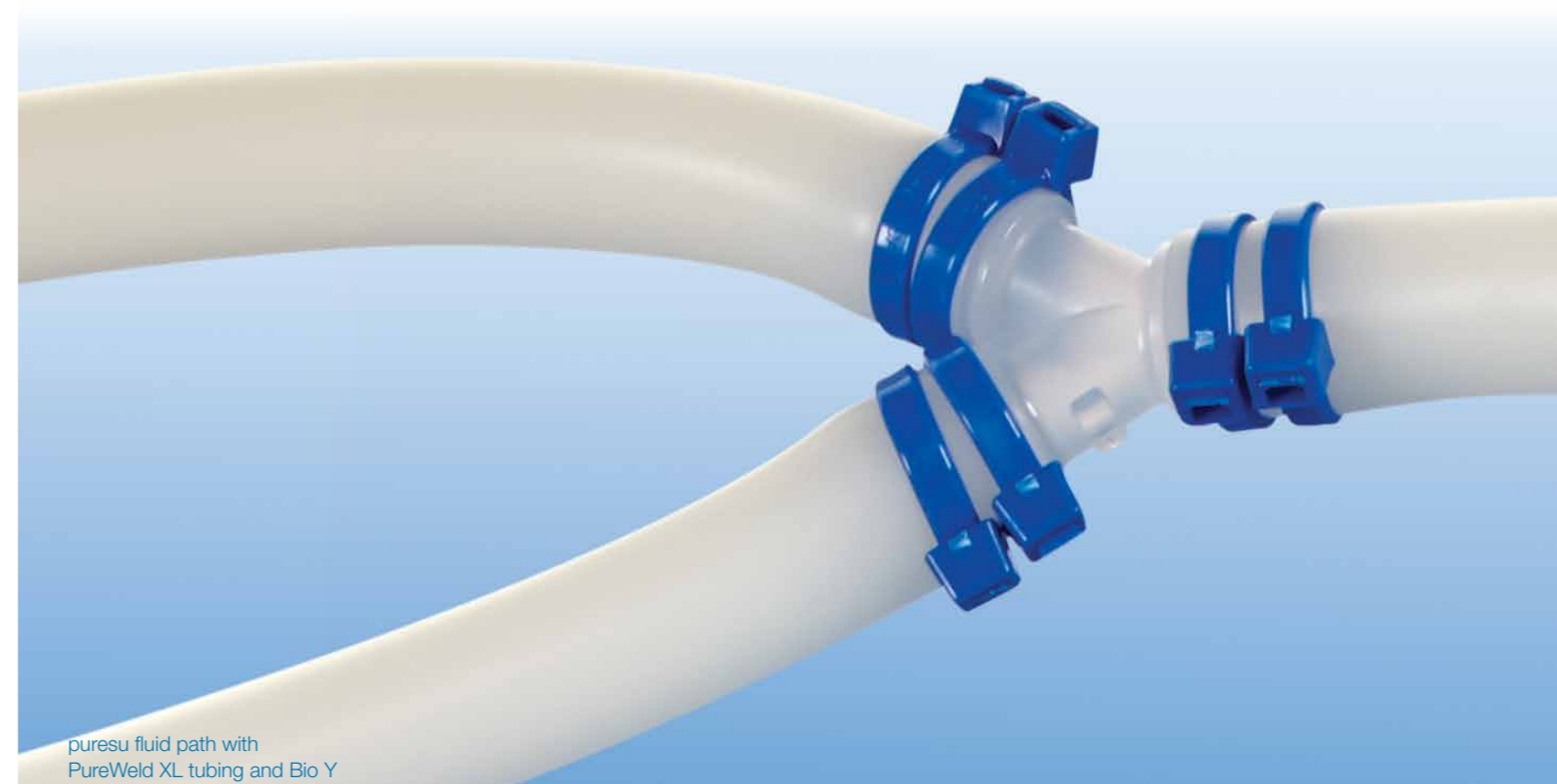
pureSU fluid path with PureWeld XL tubing and Bio Y